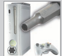
Perfectly fit for Nintendo, Sony, Sega video games