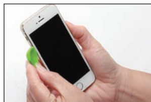
Designed for prying, poking, scraping and opening tools.