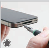
Pentalobe tips:P2 for iPhones,P5 for Macbook, P6 for Macbook Pro

The P2 、 P5 、 P6 pentalobe tips are special for Apple products.