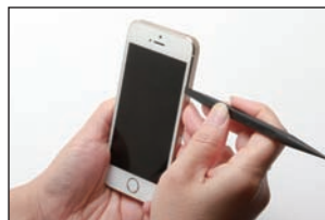
Reinforced nylon spudger is designed for prying, poking, scraping, routing, flipping, detaching, attaching and opening devices.