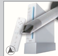
Works on most "Happy Meal" toys